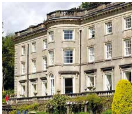
Left: the Georgian elevation Below: the Mawson terrace and partierre pre-2019

Since that time, in partnership with English Heritage the Diocese has engaged in an extensive programme of restoration of the buildings, the grounds, the hydro-electric system – but most importantly for the purposes of this article – of the formal gardens designed and built by Thomas Mawson (1909-1911). In the turbulence of the two world wars and the letting out of the Hall to various bodies after 1940, the formal gardens