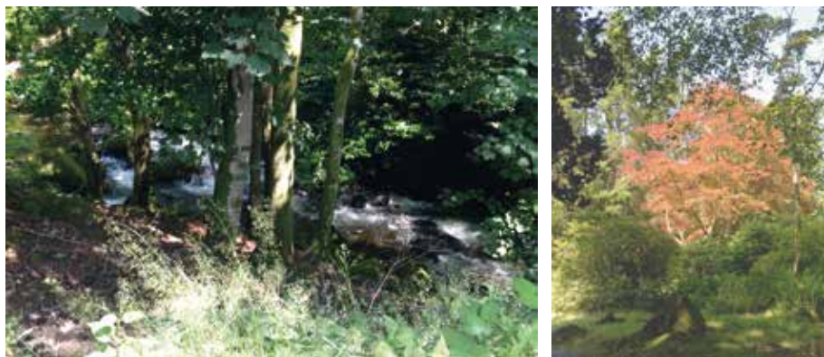
Above: woodland with Rydal Beck (left)

area of relaxed and tranquil woodland with ponds and paths leading down to the summerhouse and Lower Rydal Beck waterfall, demonstrating this famous landscape ideal of working in harmony with nature.'