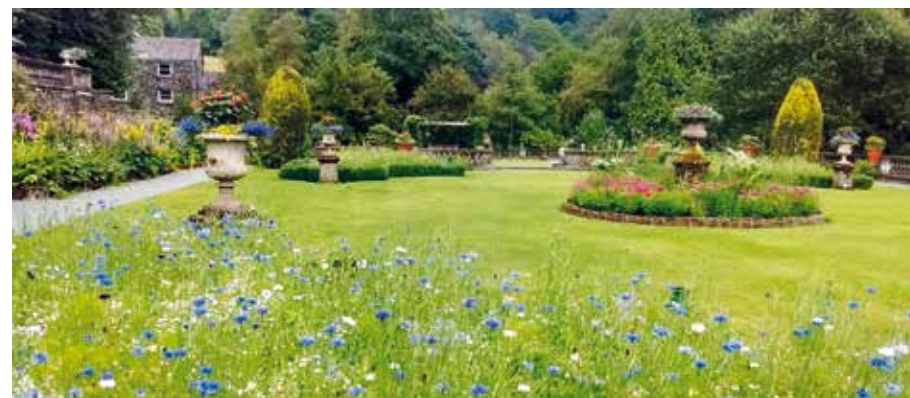
Above: Rydal Hall today with wildflower planting

Mawson started out as a builder, moved into landscape gardening and later set up Lakeland Nurseries. One of his strengths as a garden designer was his ability to create landscapes using his whole mix of skills to emphasise the connection between the built environment and its immediate landscape – so there is often that interesting interface between the house and the formal garden, the edge of the formal garden and the view over the natural landscape. Trademarks of a Mawson garden are terraces bordered by stone balustrades close to the house and at lower levels, timber pergolas supported by stone pillars, sweeping steps and garden ornaments – especially planting urns set along balustrades and at focal points in a parterre design. All these are present at Rydal Hall. Here he also conforms to the syntax of a formal garden with the axial and symmetrical arrangement of paths and beds which are typically fringed